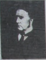
SIR WILLIAM WITHEY GULL.

BE LIEVED TO HAVE BEEN INVOLVED IN THE MURDER AND OF NUMEROUS WOMEN IN THE WHITECHAPEL AREA.